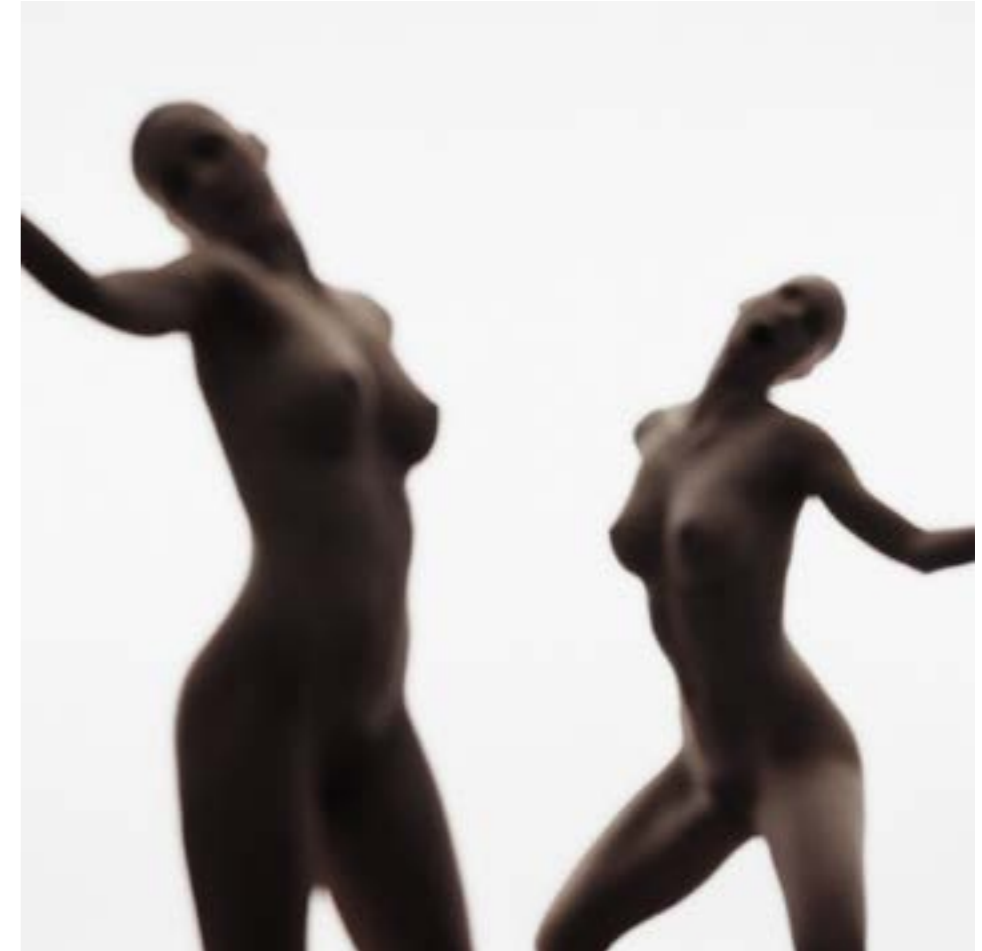
Artwork: Yves G. Noir, 2007 - Series: „Focus ∞“